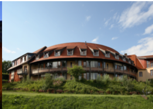
CAM Interest Group EP 01072015 AM